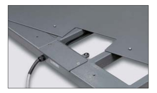
Weighing plate can be unscrewed - The weighing plate can be conveniently unscrewed for maintenance or cleaning purposes

Weighing bridge with screwed-on weighing plate (IP67) and XXL display device, with EC type approval [M]