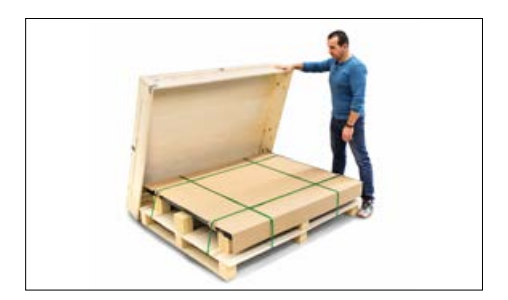
Did you know? Our floor scales are delivered in a robust wooden box. This protects the high-quality weighing technology from environmental influences and stresses during transportation. KERN – always one step ahead