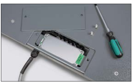
Easy levelling of the weighing bridge as well as access to the junction box from above