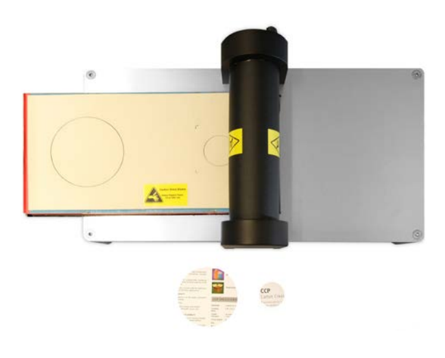
More than 5 different sized shapes or additional punched holes within shapes.