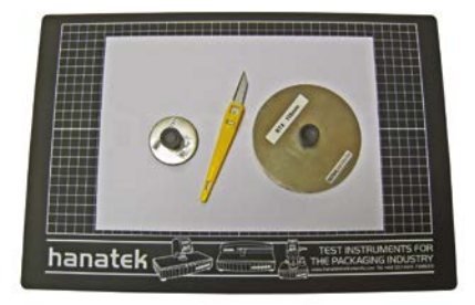
Sample template cutter for 50mm and 115mm ø included with instrument. Suitable for low volume testing.