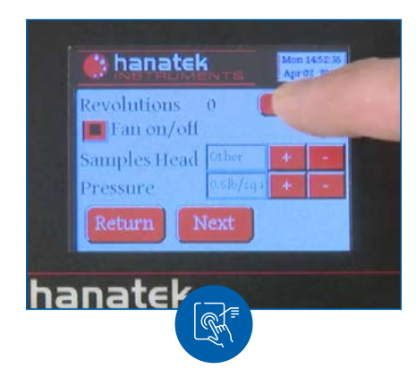
Touch screen operation ensures quick configuration of test parameters