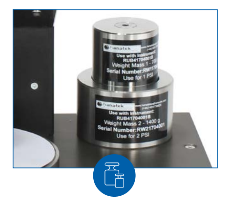
Choice of weights to comply with BS3110 methods for measuring rub resistance of print