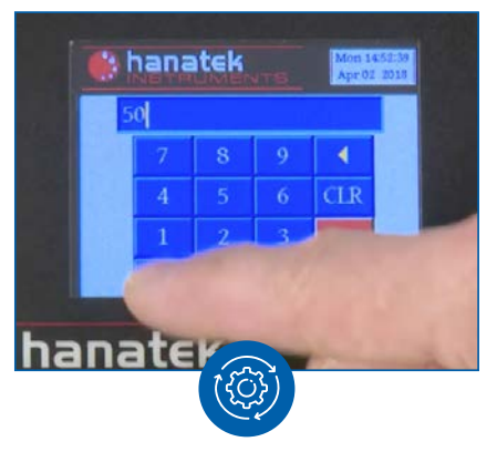
User-configurable cycle times allow tests be to run unsupervised