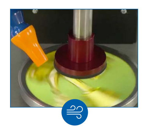
Air feed hose to remove fibres and debris which act as abrasive agents