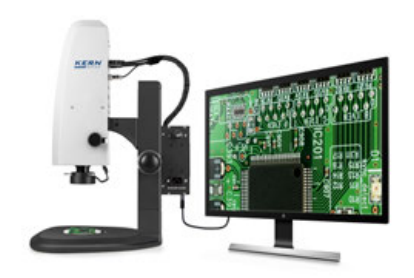
Side view with screen connected (not included with delivery)