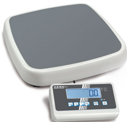
KERN MPC 250K100M