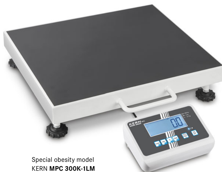
Special obesity model KERN MPC 300K-1LM