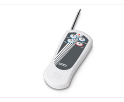
Radio remote control standard. Range up to 20 m. All functions can be selected. W×D×H 65×24×100 mm. Batteries included, 1× 12 V 23A