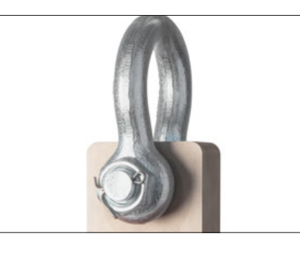
Solid shackles, non-revolving