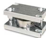
Fig. shows accessories, load corner SAUTER CE Q42901, for further accessories please visit our online shop