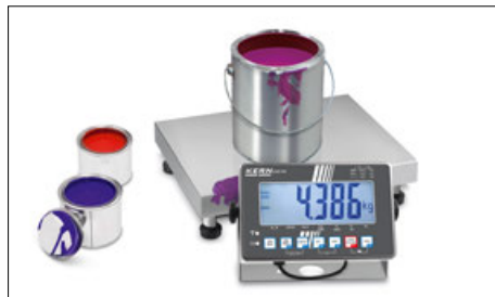
Durable stainless steel weighing plate