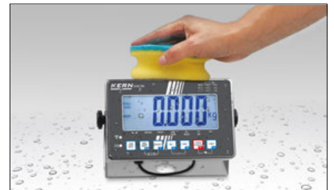
Stainless steel display device with IP68 protection, hygienic and easy to clean