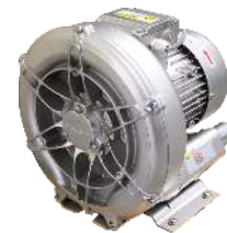
Cooling blower TB 0080