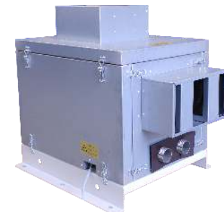
Acoustic enclosure TB 0080-AE (optional)