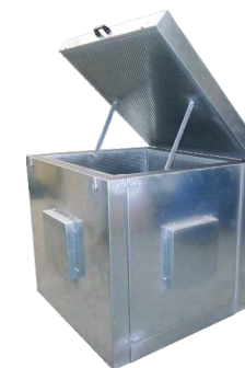
Acoustic enclosure TB 0310-AE (optional)