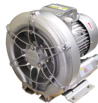
Cooling blower TB 0310