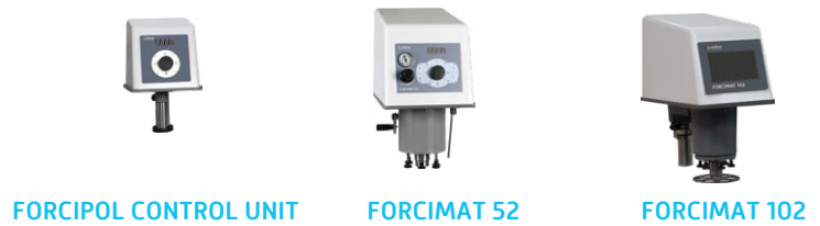
FORCIPOL CONTROL UNIT

FORCIPOL Control Unit: For Manual Operation FORCIMAT 52: For Semi Automatic Individual Force Operation FORCIMAT 102: For Programmable Automatic Individual and Central Force Operation