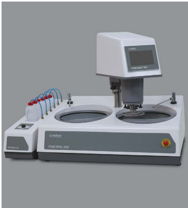
FORCIPOL 202 with FORCIMAT 102 & DOSIMAT 12

Optional encoder allows you to measure the amount of material removed from the surface. The desired grinding depth can be set to grind different type of samples and also for applications that need special accuracy.