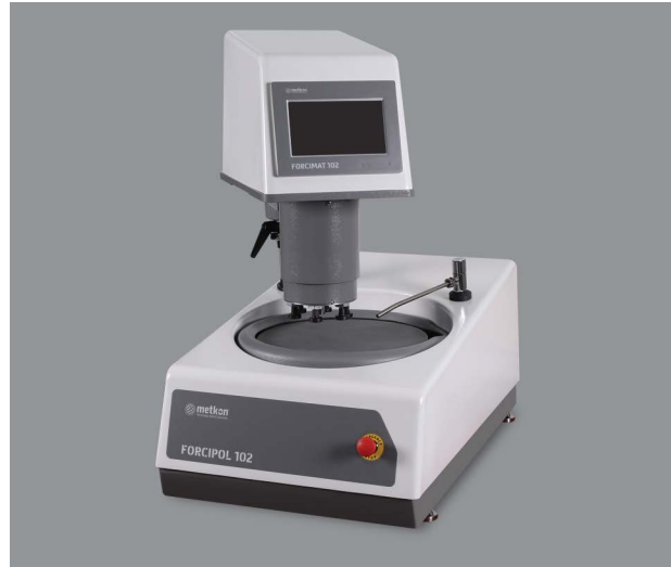
FORCIPOL 102 with FORCIMAT 102

The "soft start and stop" feature automatically starts the sequence with a low initial force which is then increased to the preset. Towards the end of the cycle, the force is automatically reduced to 75 % of the setting to prevent scratching. A variety of sample holders for individual or central force applications are available for different sample sizes. Both individual and central force specimen holders can be removed and inserted easily with the help of quick release chuck. By holding the head button on the software, the specimen holder will rotate for easy insertion and removal of the specimens.