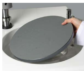
Simple exchange of working discs