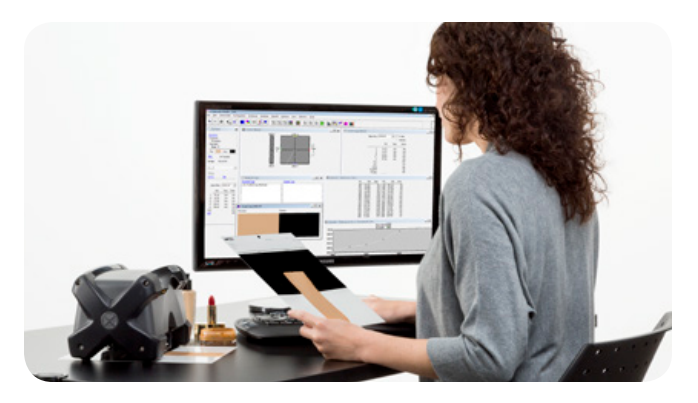
Custom product database creation and maintenance through our fully facilitated US laboratory.

Developed for industries that deal with the nuances of skin color—fashion, plastic surgery, animation, and photography, as well as retail cosmetics—skin tone guides organize colors by tone value and undertone, making the task of skin tone assessment easier.